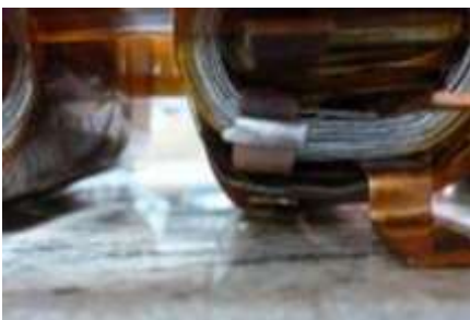
Copper bars of transformers 变压器上铜条