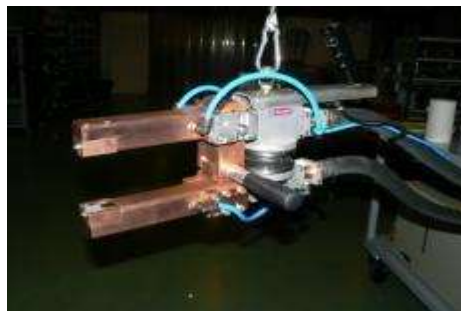
Single lock PIAB 55