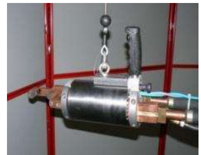
PIAB rotating at 90° PIAB 旋转 90°