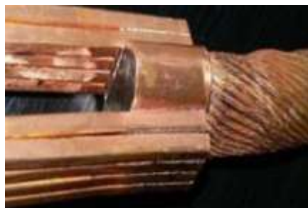
Power connection brazing 电源接头钎焊