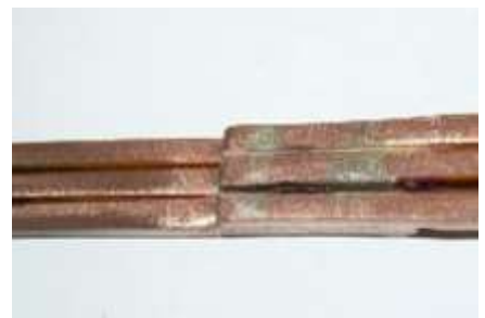
3 Copper wire brazing 3 根铜条钎焊