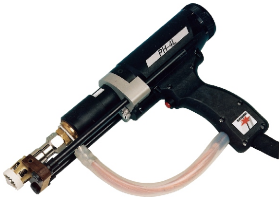
PH-4L螺柱焊枪 PH-4L stud welding gun