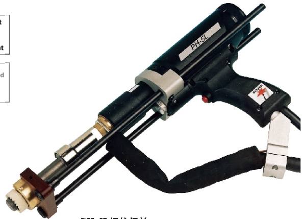
PH-5L螺柱焊枪 PH-5L stud welding gun