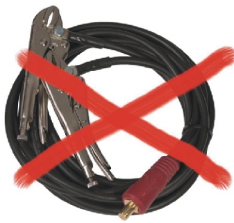
不需要额外连接地线 No extra ground cable needed!