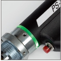
PS-9螺柱焊枪带指示灯 (专利号: 20 2009 01 2 370.7)