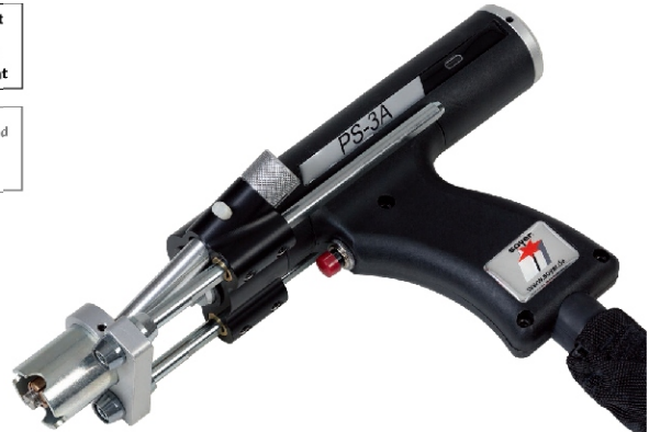
PS-3A自动焊枪 PS-3A automatic welding gun