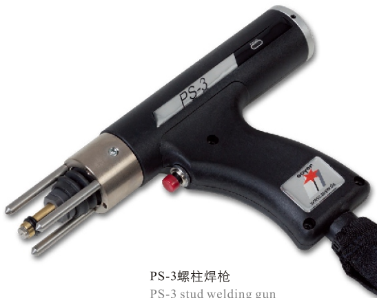
PS-3螺柱焊枪 PS-3 stud welding gun