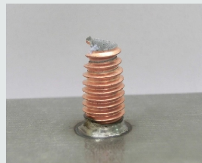
b) M12 抗拉力测试, 螺柱断裂 Tensile test. Weld stud fracture.